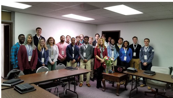
Precision Practice Management